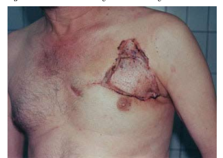
Fig 3-b Chest carbuncle following closure with skin graft