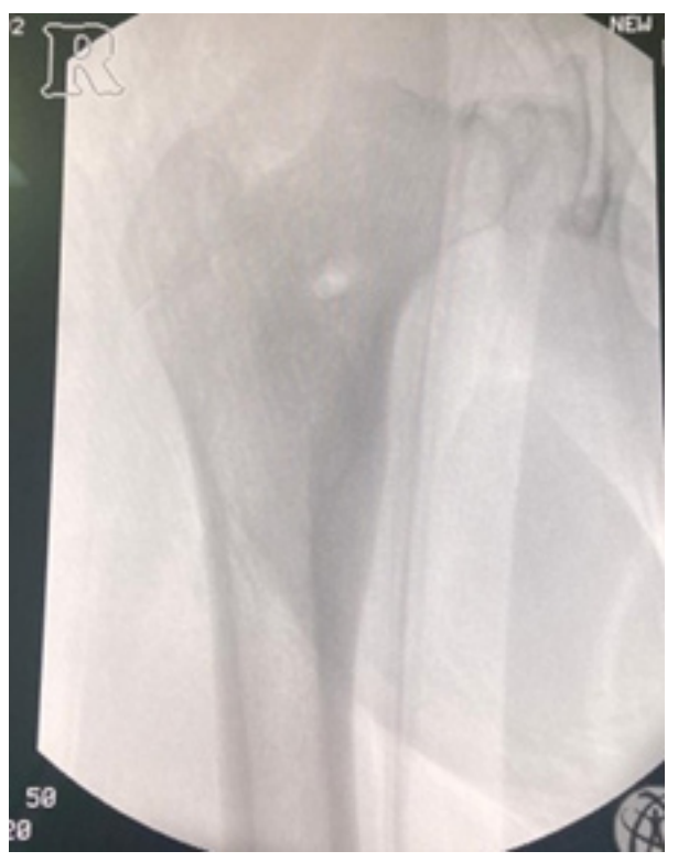
Figure 3: A Guide wire was inserted under guidance and was drilled through target lesion.