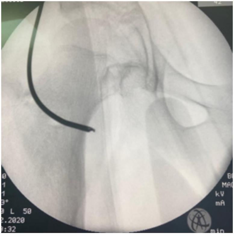
Figure 4: Size 6.5 cumulated drill to ensure complete excision.