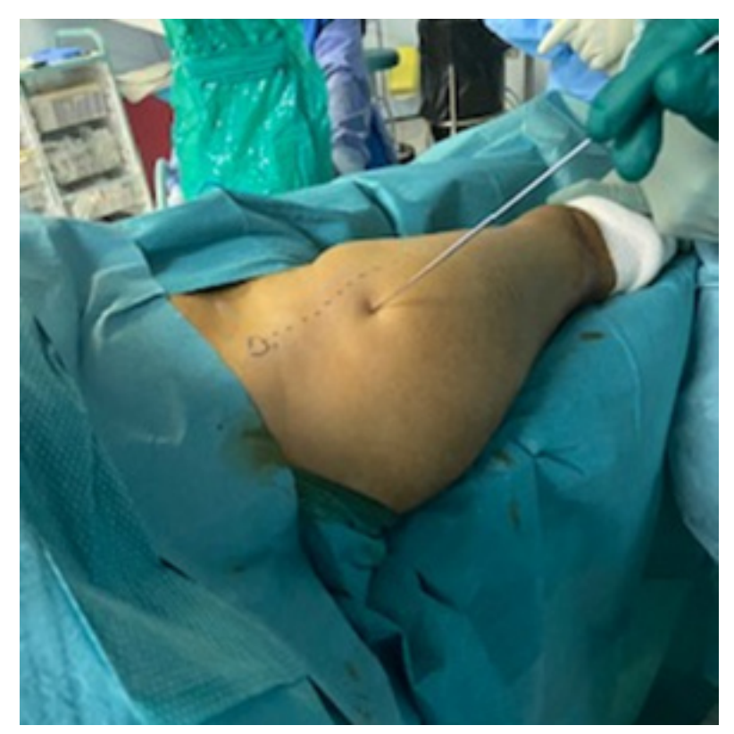
Figure 5 : Bone tissue samples were obtained from the Drill bit and were sent for histopathological examination.