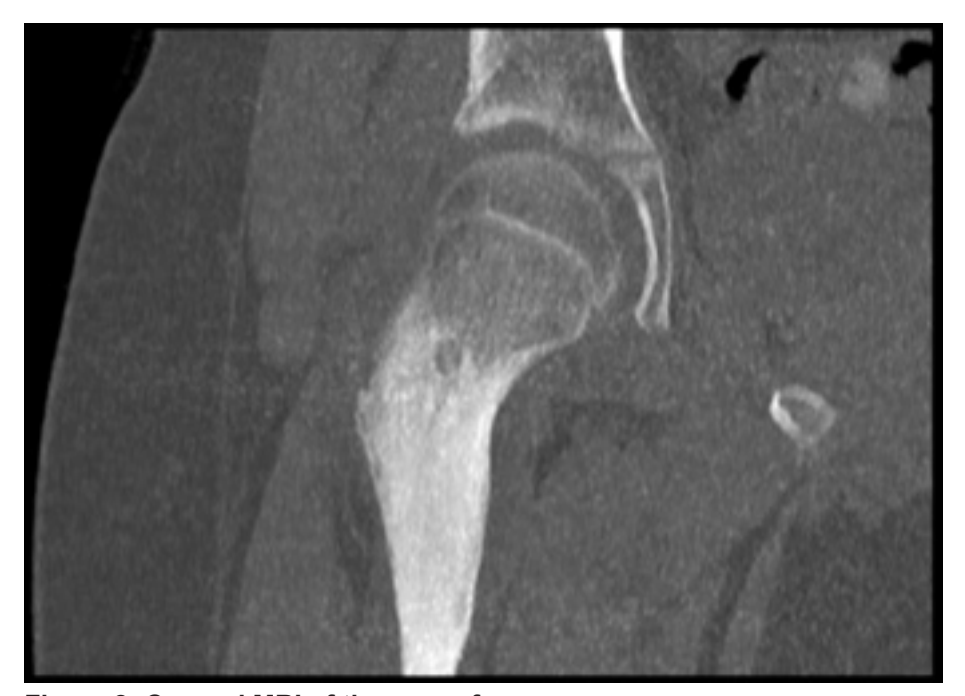
Figure 2: Coronal MRI of the upper femur