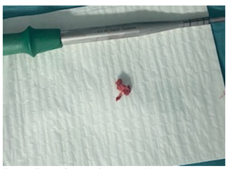
Figure 6: Final confirmation of complete excision was done using c arm.