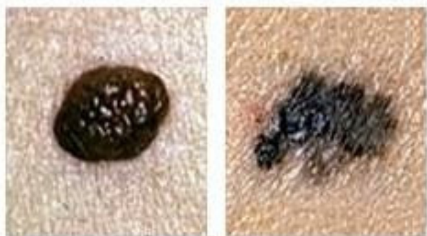
Normal Mole –