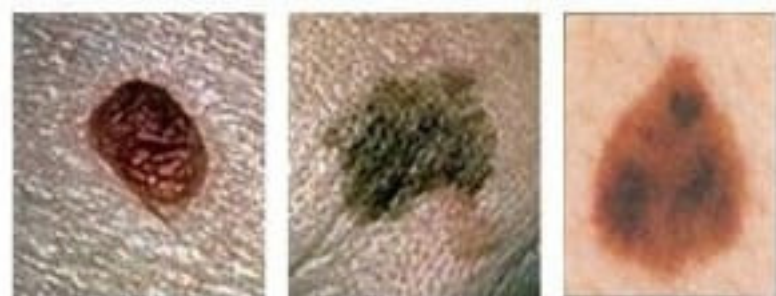
Normal Mole –