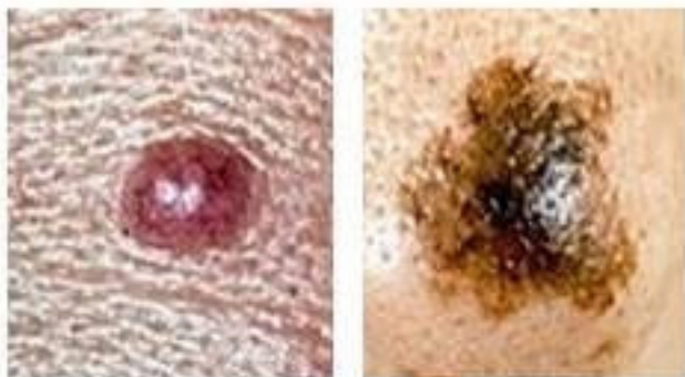
Normal Mole –