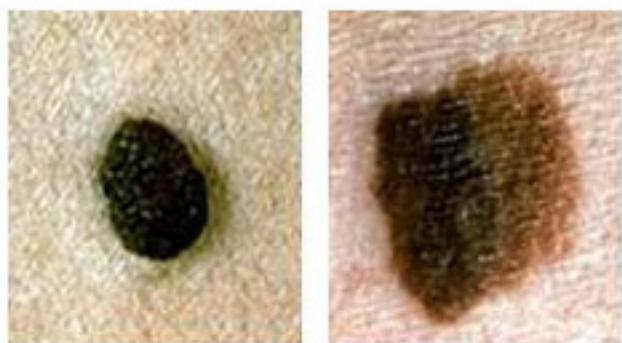
Normal Mole –