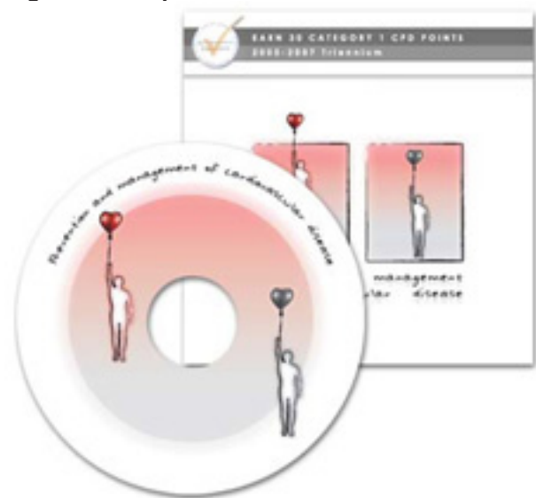
Figure 2: Sample Multimedia Educational title