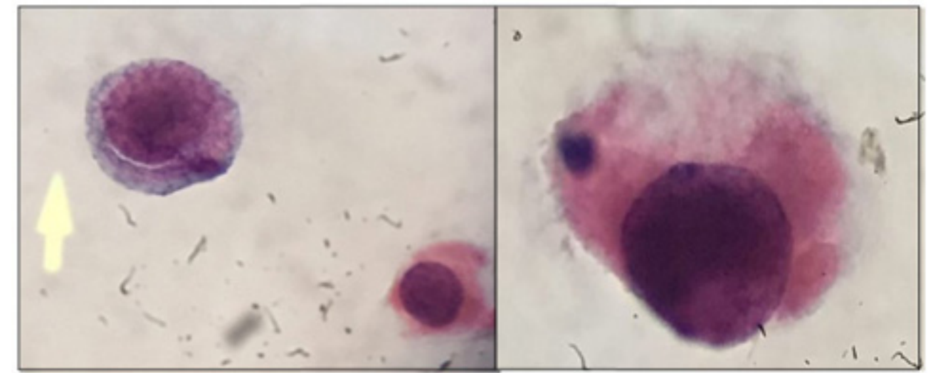
Figure 2: Decoy cells with enlarged nucleus with a baso-philic intra-nuclear inclusion (papanicolaou stain *400)